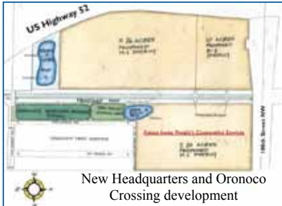
New Headquarters and Oronoco Crossing development

The Cooperative is also promoting the development of Oronoco Crossings - a 36 acre Commercial/Industrial development adjacent to the new headquarters location in Oronoco.