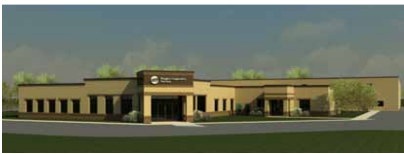
Rendering of new People's Cooperative Services building.

Detail design discussions continue for the interior office spaces of the main office. Each room will be analyzed relative to its intended use, utilities requirements, furnishings, and fixtures. We intend to utilize as much of the current office furniture as possible.