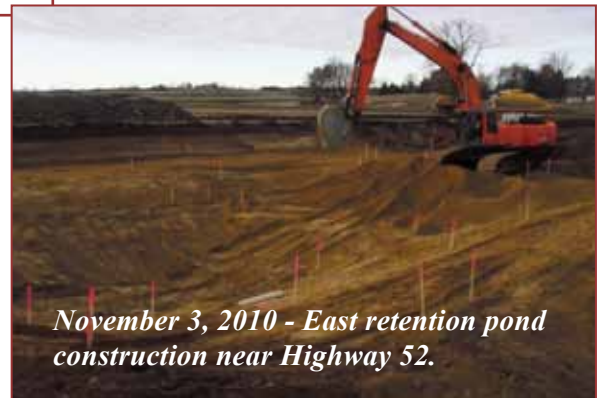
November 3, 2010 - East retention pond construction near Highway 52.

Shafer Construction has been awarded the frontage road construction contract from MNDOT. Construction is due to begin next spring. In the meantime, a temporary access road will be built to allow access to the construction site. Three thousand eight hundred seventy-four.