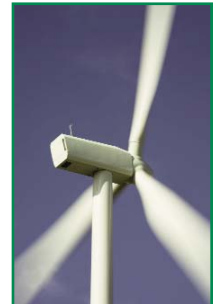
Iberdrola's Winnebago Wind

power plant to be located in Cassville, Wisconsin. The facility, that will burn wood waste, is planned to come on-line in June 2010.