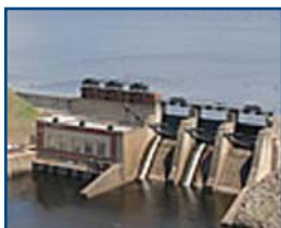
Flambeau Hydroelectric Station

Station since 1951. The plant is located on the Flambeau River near Ladysmith, Wisconsin. In addition to operating the