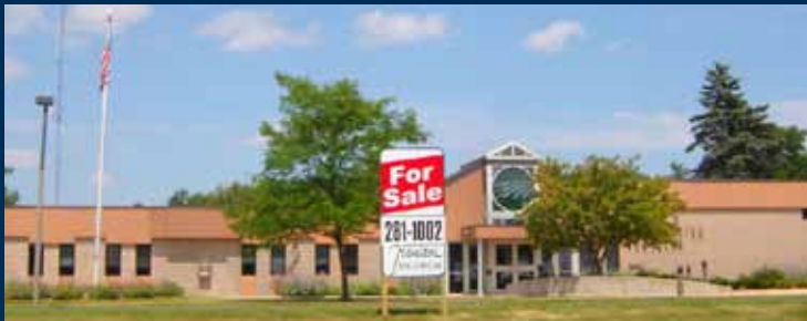
People's Cooperative Services existing headquarters and adjacent land on Highway 14 East, Rochester is listed "For Sale"

We have moved the webcam to a higher vantage point for improved coverage of the site. Be sure to follow the progress at www.peoplesrec.com .