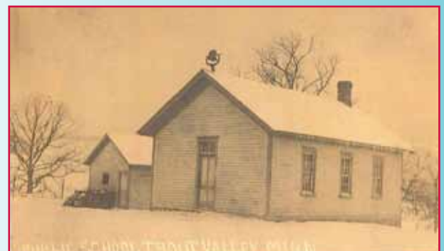
Public School - Trout Valley, MN