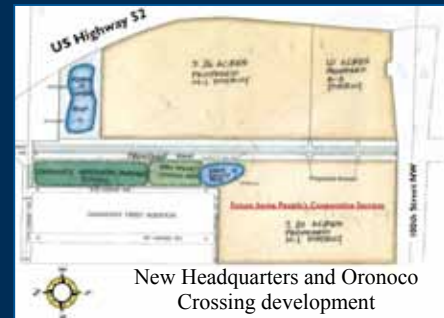
New Headquarters and Oronoco Crossing development