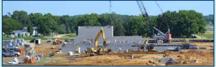
People's Cooperative Services new headquarters building.

Construction of the frontage road has stopped due to the government shutdown. The drainage ditches have been dug out and seeded and the roadbed has the compacted