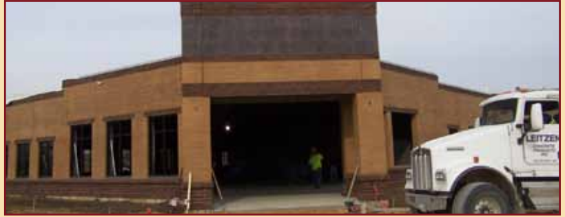
People's Cooperative Services new headquarters building under construction.

General site grading continues along the east side of the building. Driveways, parking areas, and the pole yard are being set to final grade.